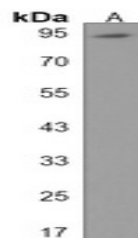
Western blot analysis of NSMAF expressio...