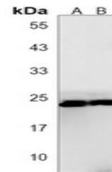
Western blot analysis of RGS19 expression...