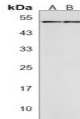
Western blot analysis of SLC25A25 expres...