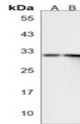
Western blot analysis of XAF1 expression...