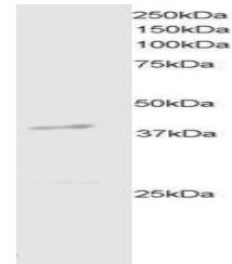
orb18331 staining (2ug/ml) of mouse brai...