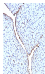
IHC staining of FFPE human bladder tissue...