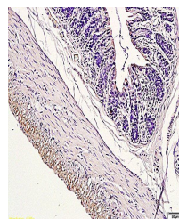
Immunohistochemical staining of rat colo...