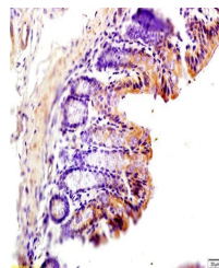
Immunohistochemical staining of mouse in...