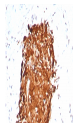
IHC staining of FFPE human testicular carcinoma tissue.