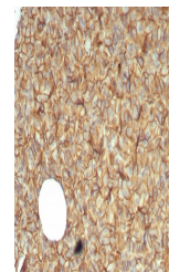
IHC staining of FFPE human pancreas tiss...