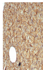
IHC staining of FFPE human pancreas tiss...