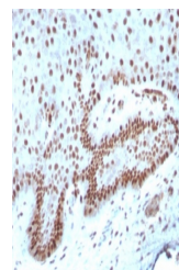
IHC staining of FFPE human cervix tissue...