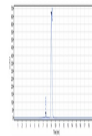
The purity of Anti-FOLR1 / FRA Reference...