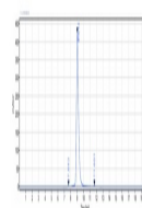
The purity of Anti-Complement C5aR1 Refe...