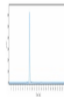
The purity of Anti-CXCR5 / CD185 Referen...