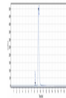
The purity of Anti-TROP2 Reference Antib...