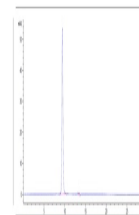
The purity of Anti-TPBG Reference Antibody...