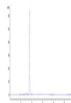
The purity of Anti-TIGIT Reference Antib...