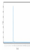
The purity of Anti-TNFRSF8 / CD30 Refere...