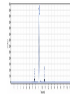
The purity of Anti-RSV-F Reference Antib...