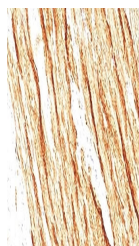
IHC staining of FFPE human colon tissue ...