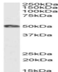
Western Blot using anti-CD2 antibody YTH...