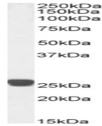
Western Blot using anti-Cardiac Troponin...