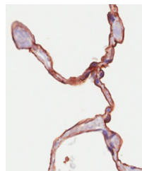
Immunohistochemical staining of human lu...