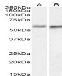
Western Blot using anti-BACE2 antibody 1...