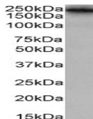
Western Blot using anti-Lewis a-b antibody

Expiration Date 12 months from date of receipt.