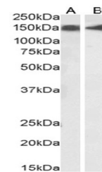
Western Blot using anti-CD56 antibody NC...