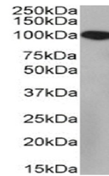
Western Blot using anti-CD10 antibody FR...