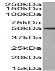
Western Blot using anti-CD63 antibody NK...