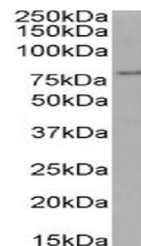
Western Blot using anti-FOXP4 antibody N...