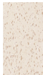
IHC-P analysis of rat brain using phosph...