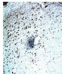
Immunohistochemical analysis of paraffin...