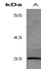
Western blot analysis of HO-1 expression...