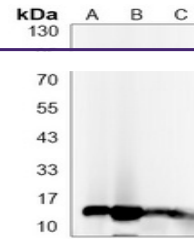
Western blot analysis of Histone H3 (Acetylated)