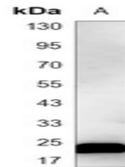
Western blot analysis of LIN28A expressi...