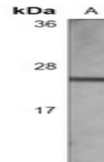
Western blot analysis of TIMP2 expressio...