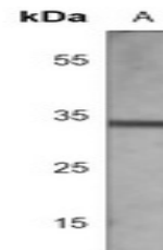
Western blot analysis of EPHB2 expressio...