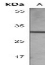
Western blot analysis of PPT expression ...