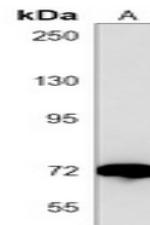
Western blot analysis of ACOX1 expressio...