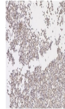
SARS-CoV-2 Spike RBD Antibody (clone 216...