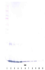
To detect Rat GM-CSF by Western Blot ana...