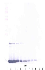
To detect Rat GM-CSF by Western Blot ana...