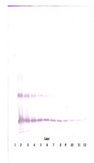
To detect hIL-33 by Western Blot analysi...