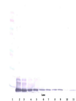
To detect mMCP-3 by Western Blot analysi...