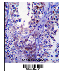
SDF2L1 Antibody immunohistochemistry ana...