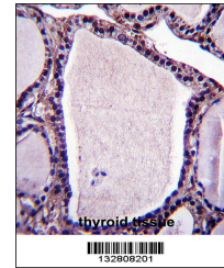
NSMAF Antibody immunohistochemistry anal...