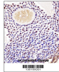
Mouse Wee2 Antibody immunohistochemistry...