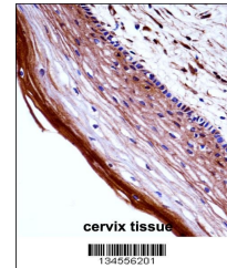
PGF Antibody immunohistochemistry analys...