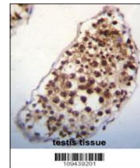
SNRK Antibody immunohistochemistry analy...