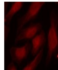
Immunofluorescence staining of methanol-...