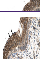
Antibody used in IHC on Human Spermatozoph...