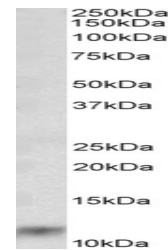
orb12338 (0.03 µg/mL) staining of Human...